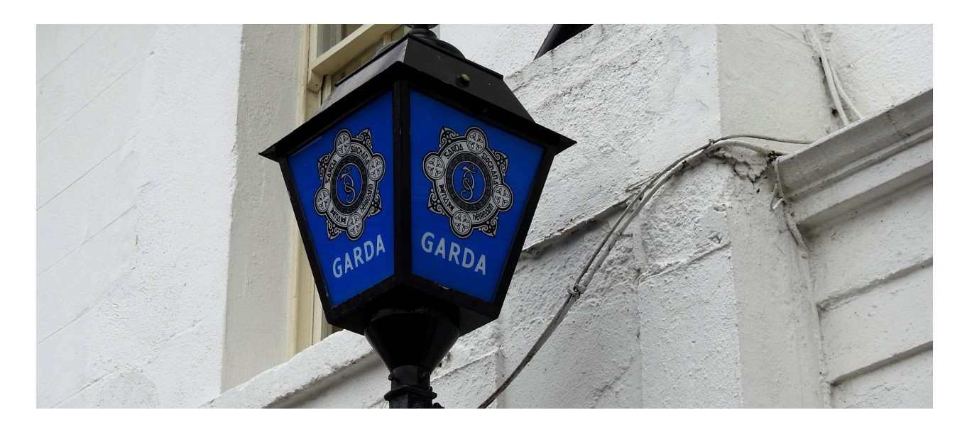
Moving Forward. Together | Ag Bogadh ar Aghaidh. Le Chéile.